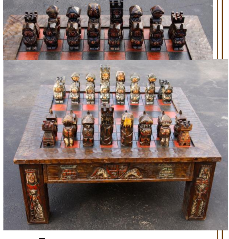
FROM JUNK TO TRUNK

Old chests and trunks are found in almost everyone's basement, attic, garage or stuffed somewhere in the back of a closet. Often they were the travel gear of relatives in the past; are you hanging on to one of these sentimental family treasures?