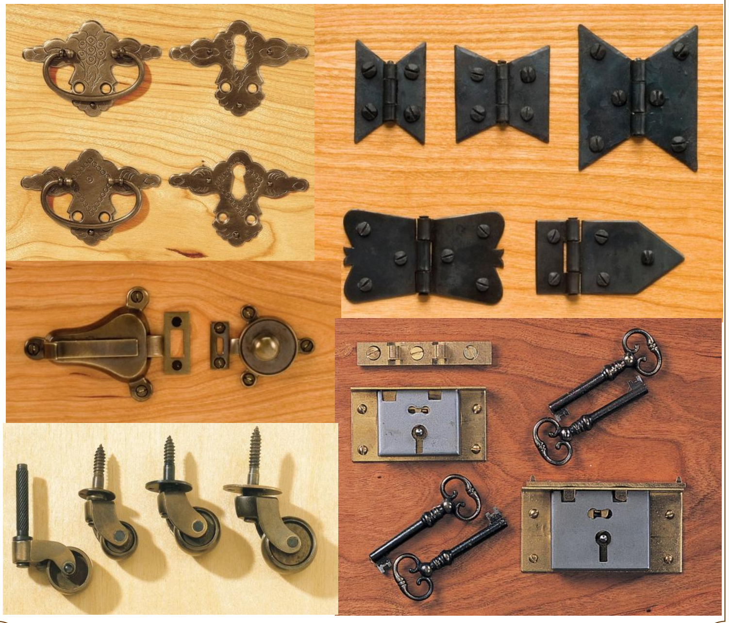
For More of Horton Brasses Visit: <a href="http://www.horton-brasses.com/">http://www.horton-brasses.com/</a>

Artisans will be collaborating with Horton, as well as many of our affiliates, suppliers, and other resources to interlink our websites, newsletters, blogs, and other venues to reduce our marketing costs while still expanding our visibility. Keep watching for more Horton Brass features!