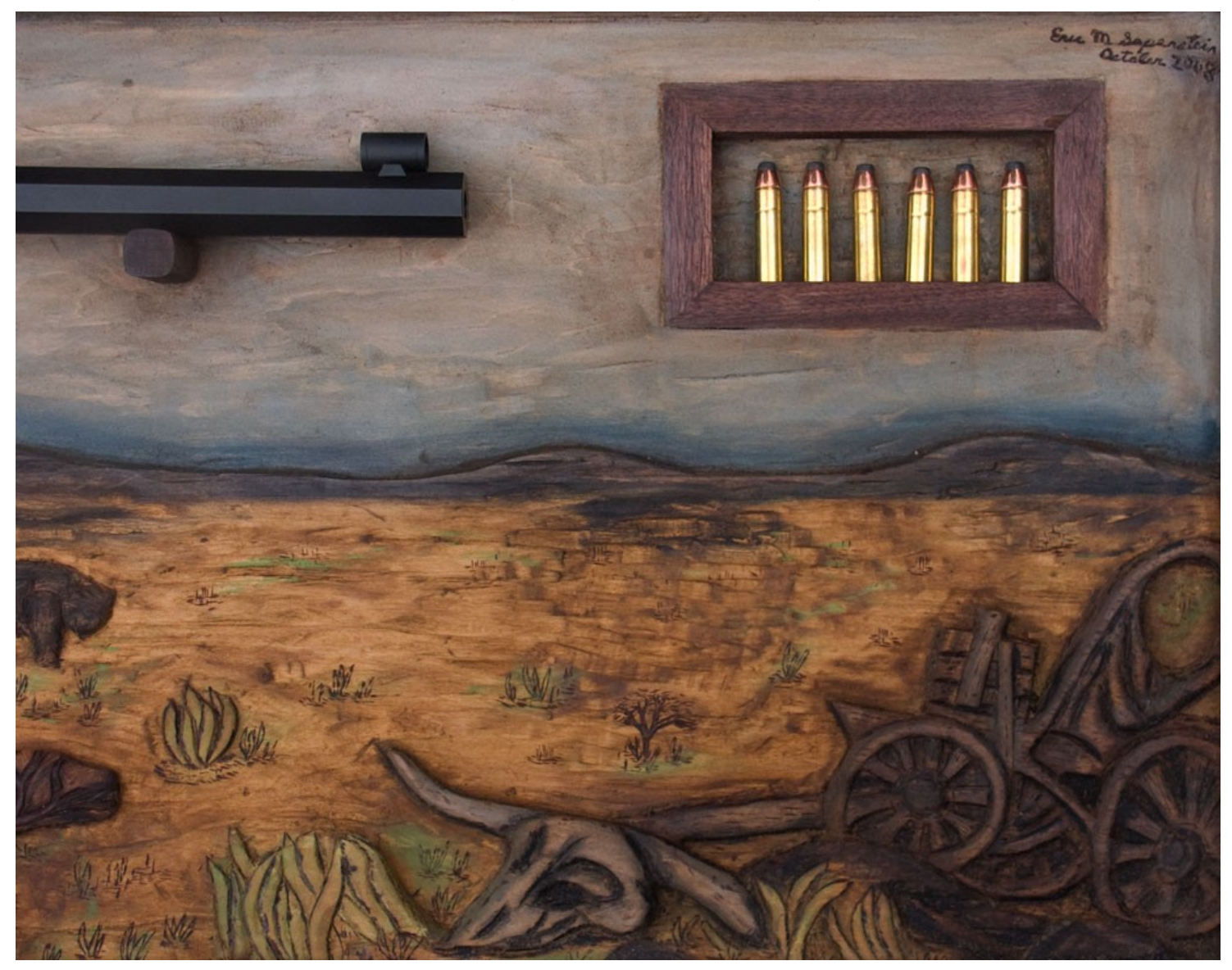
Painting & Final Detail