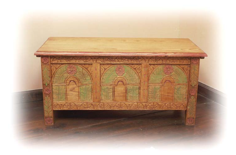
Hand Carved Oak Blanket Chest, Circa 1650